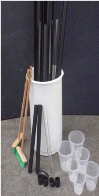
Some of the new resources

The babies and toddlers still access the outdoor area every day even though the new resources are directed at the 2-5's